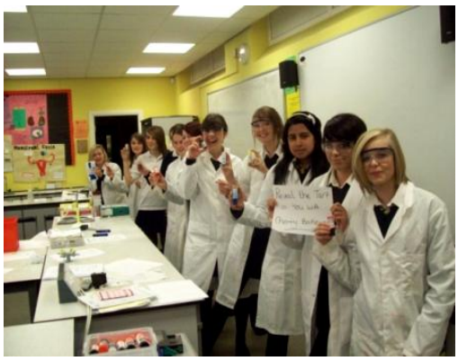
Women into Science and Engineering activities

The same framework is used for an enterprise audit in each subject area: