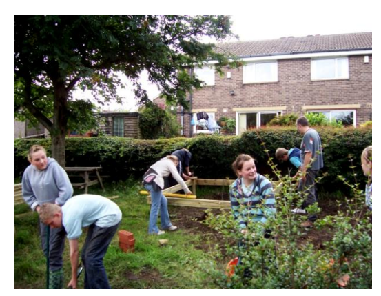
Allotment and Green Group

The school uses assemblies, pastoral time, extra-curricular activities and suspended timetable days very effectively to arrange an excellent programme of stimulating work-related activities. Many of these activities are linked directly to curriculum areas and some operate across subjects. In the recent examples listed below, students had to work with people new to them and in different and often challenging circumstances. They developed excellent employability skills by taking part in tasks, presentations and discussions that were planned as part of each activity.