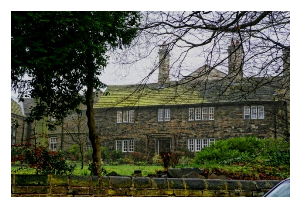
King James's School, established by Royal Charter, 1608

King James's School is an average-sized school serving an area on the eastern outskirts of